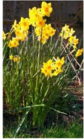
Narcissi In My Garden

Little birds are flitting around with nest building materials and there are drifts of daffodils in the grass verges. We keep hearing that seasons are starting earlier, but our WI is bucking that trend—we held our customary January lunch in February! This was due to a fear of further Covid restrictions rather than climate change - and it was worth the wait. We had a very happy get together with excellent food and service at the Hare and Hounds.